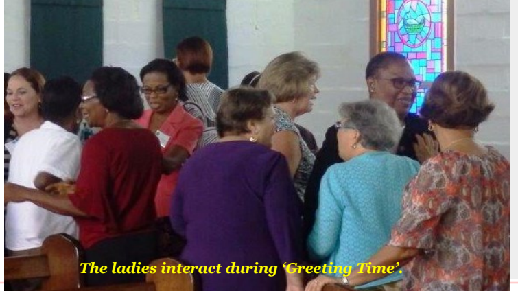
The ladies interact during 'Greeting Time'.