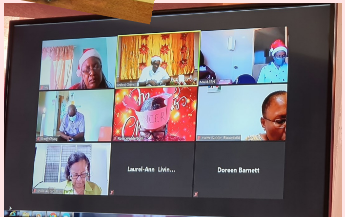
Some team members joined via Zoom platform.