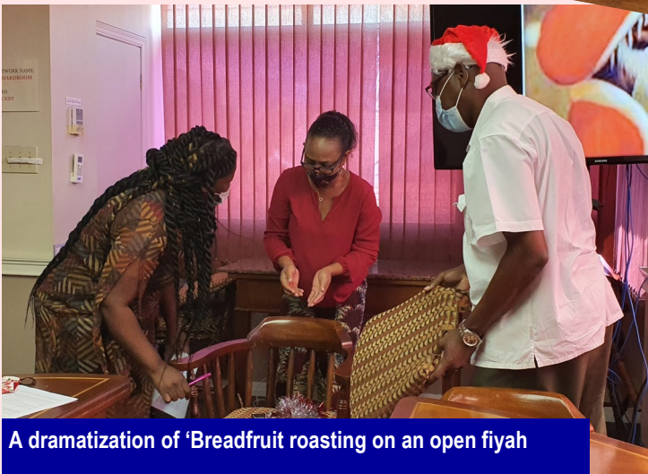
A dramatization of 'Breadfruit roasting on an open fiyah