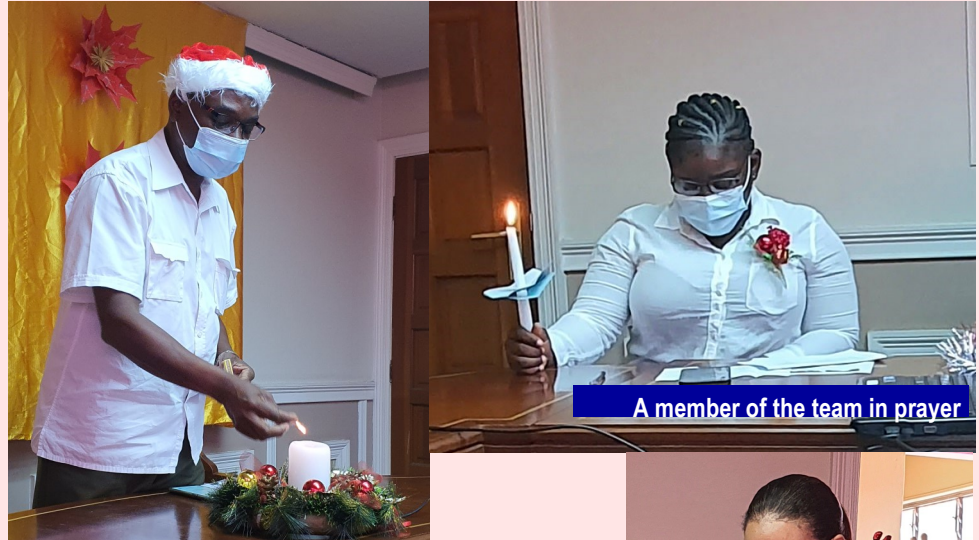
Candle-lighting was a feature of the carol service.