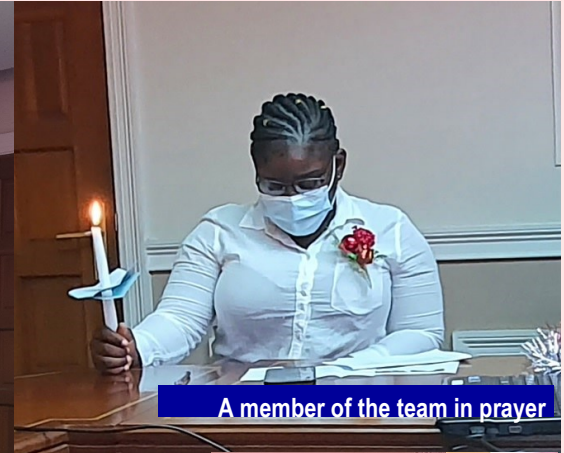
A member of the team in prayer