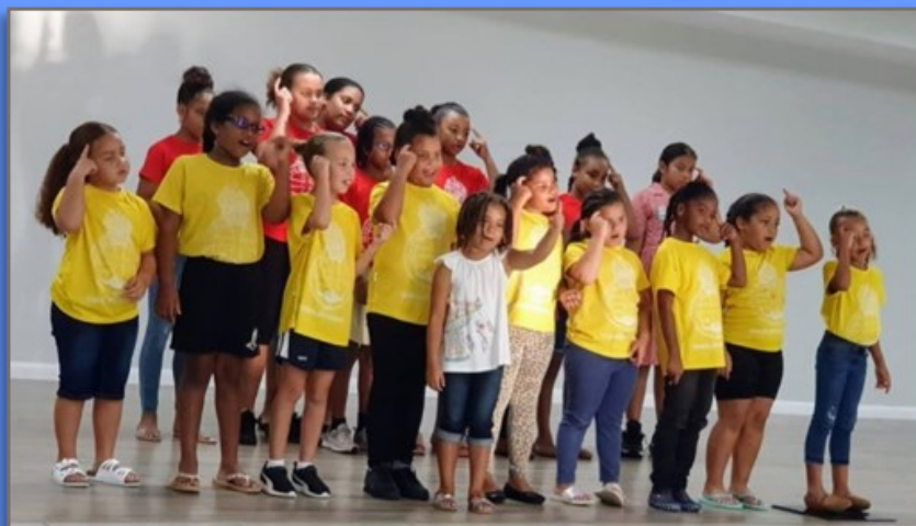
Explorers and Juniors performing at the Awards Ceremony.

The Girls' Brigade Award Ceremony for the West Bay Company was held on Monday, June 28, 2021, at the John Gray Memorial United Church Hall.