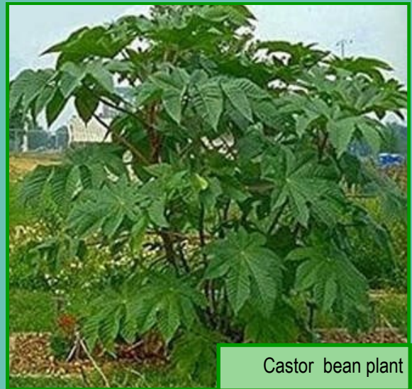
Castor bean plant

In collaboration with Food for the Poor, one and two bedroom units are provided for single mothers living with HIV and their children as well as elderly persons in dire need. Since the inception of the initiative, houses have been built in St. Ann, St. Mary, Manchester, Kingston & St. Andrew.