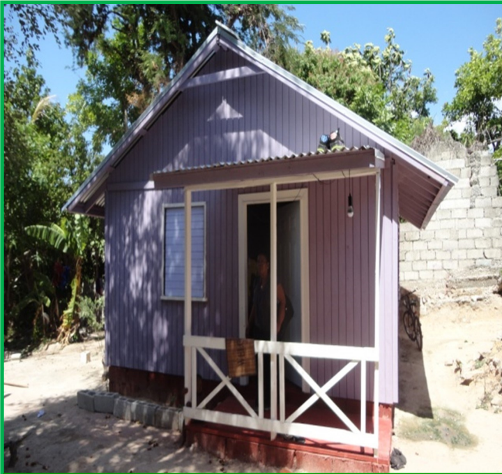
A house built in collaboration with Food for the Poor