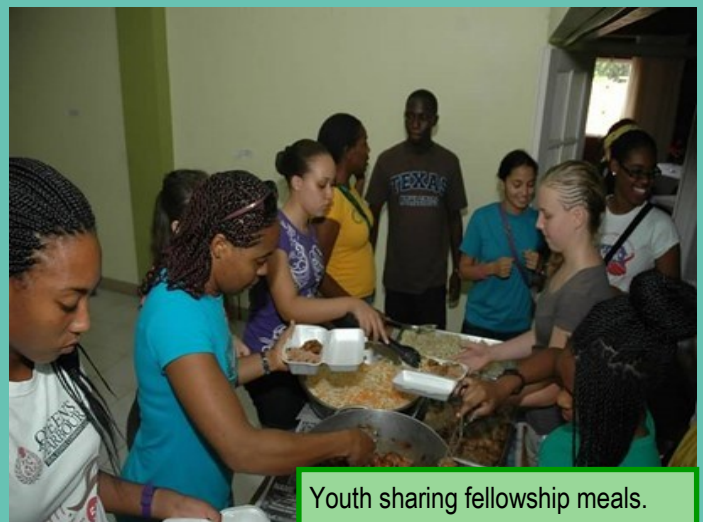
Youth sharing fellowship meals.

During that period, they are joined by local health care practitioners and they offer medical care, including filling prescriptions, doing optical work, including eye testing and issuing of reading and tested glasses and dental services, which include, extraction, cleaning as well as making and repairing dentures.