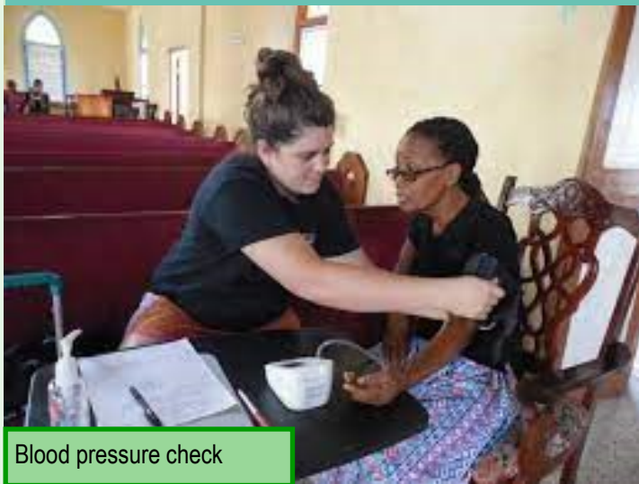
Blood pressure check

The highlight of the programme is community outreach in which the members participate. These include serving as care-givers at Children’s Homes and Homes for the Aged, painting projects at homes and schools; as well as feeding