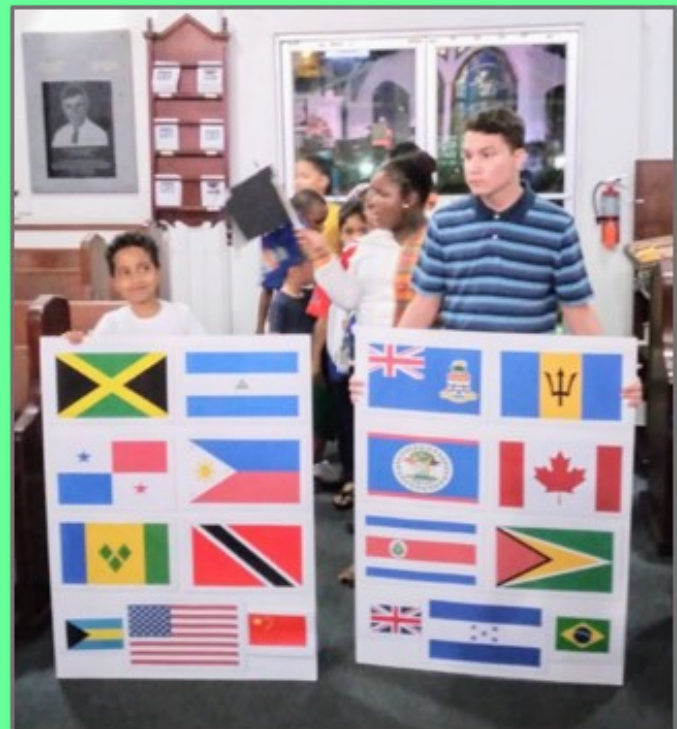
National flags of countries on display representing the diverse membership of Elmslie United Church.