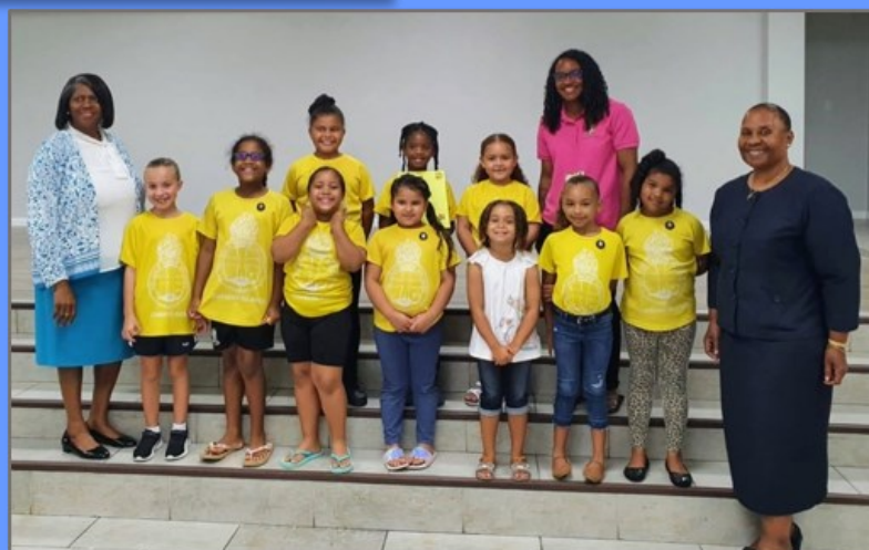
The Explorers with their leaders and the National Chaplain.