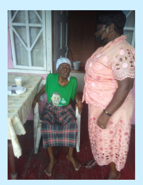
More than 20 persons in the community were fed on May 17, 2021 by the Pell River United Church Men's Fellowship. The beneficiaries were from Friendship, Caudwell and

Pell River United Church in the Riverside charge of the Western Region Mission Council, is in the spotlight in this issue of Update. The congregation has been active in mission engagement in community.