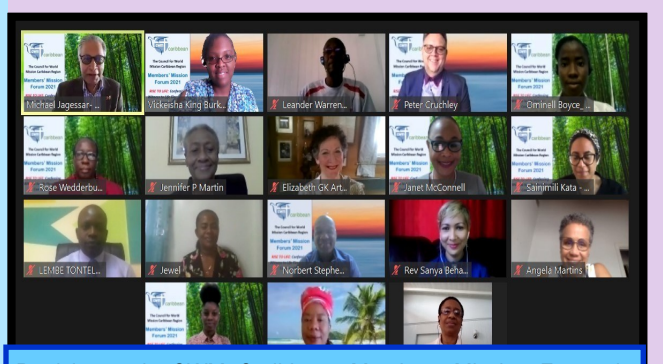
Participants in CWM Caribbean Members Mission Forum in May 2021.