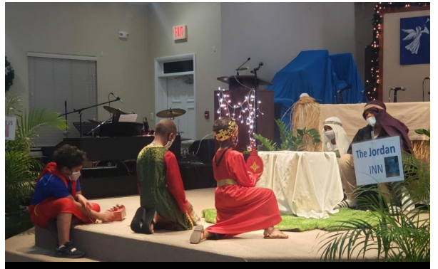
The Magi visits Mary and Joseph and worship bringing gifts