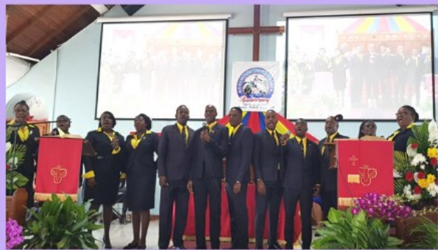
The Jamaica Constabulary Force , JCF, choir ministering in song.