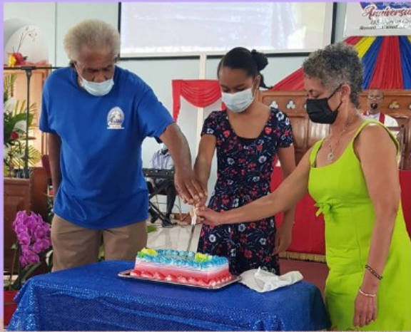
The cutting of the cake.

185 Years of Grace Rooted. United. Connected