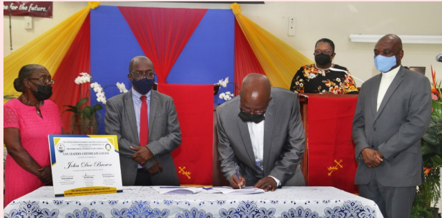
Official Signing of a Memorandum of Understanding between The United Church in Jamaica and the Cayman Islands and The International University of the Caribbean.