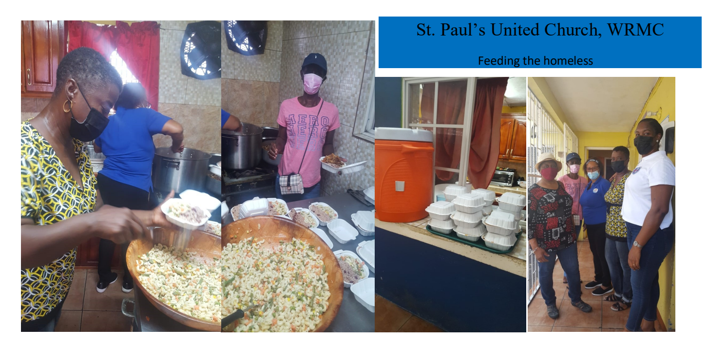
The Women's Fellowship of St. Paul's United in Montego Bay delivered 75 lunches to the homeless on April 7, 2022.