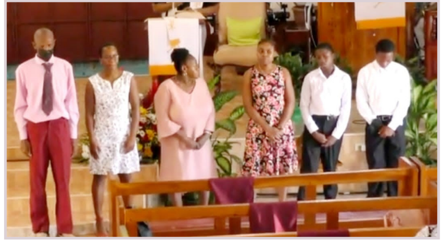
Candidates for Baptism