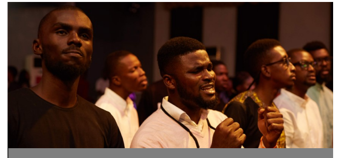
MEN'S FELLOWSHIP SUNDAY on OCTOBER 9, 2022

Jamaica is affected by all of these and more. We are beset by crime and violence, corruption and a general breakdown in values. Our younger generation is distracted by different value systems. Scamming and the general easy way out in making a living seems now to be the order of the day. We look to persons who may be regarded as less than desirable but who have become role models, and social media has become a negative influence especially on our young