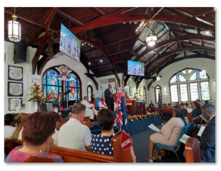
The Anniversary Service at the Elmslie Memorial Sanctuary.