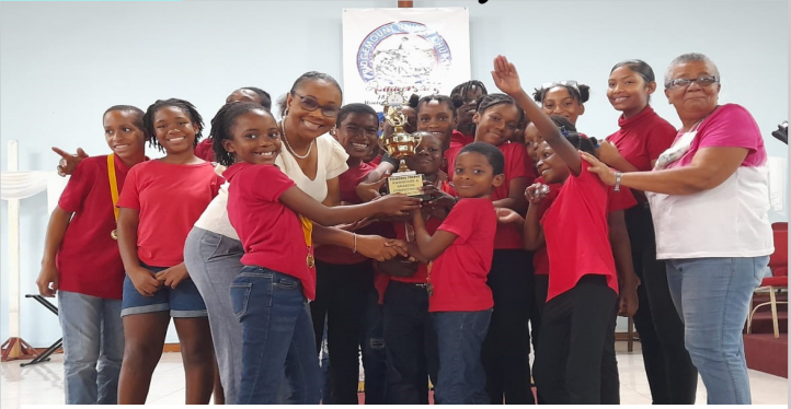
2nd Place Kids Quake